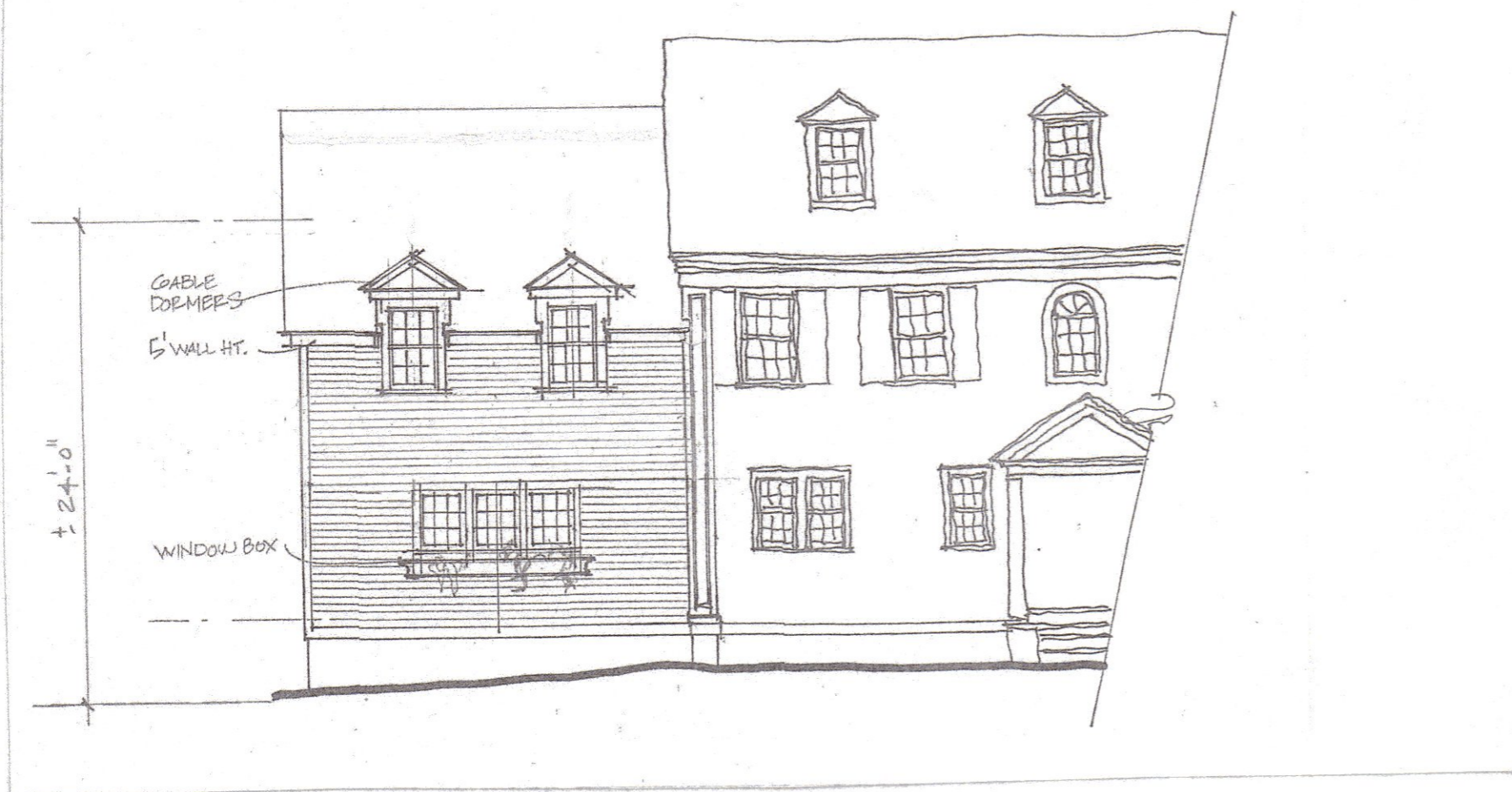
PARTIAL PROPOSED FRONT ELEVATION