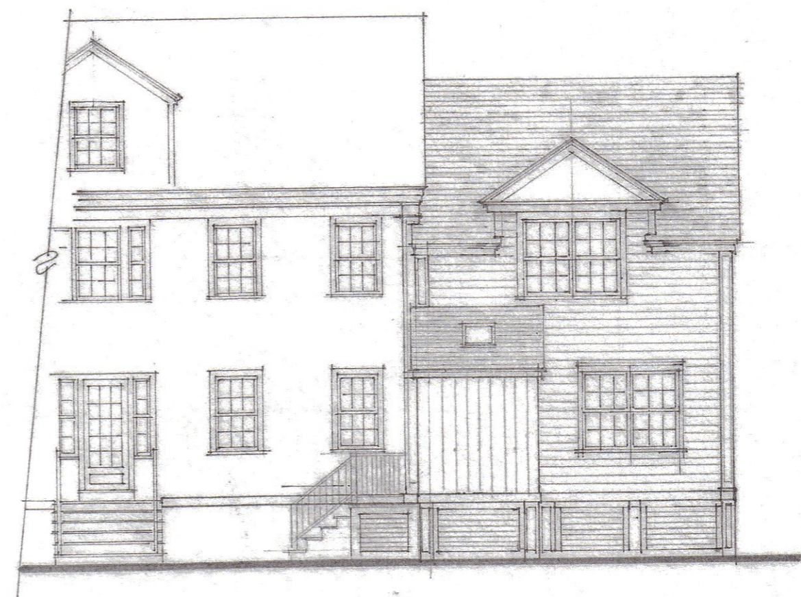
PARTIAL PROPOSED REAR ELEVATION