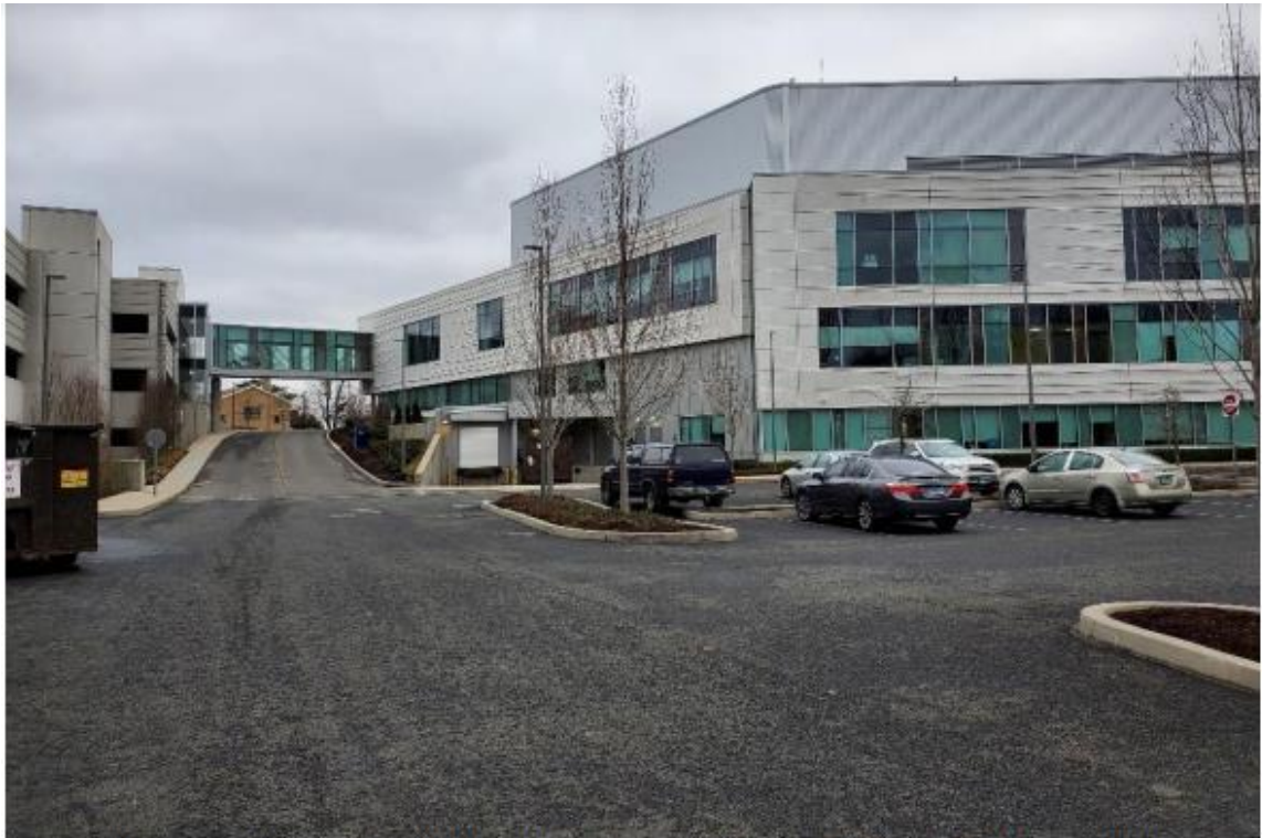
Looking west toward Facility location at center of photo (to right of trees); building in background.