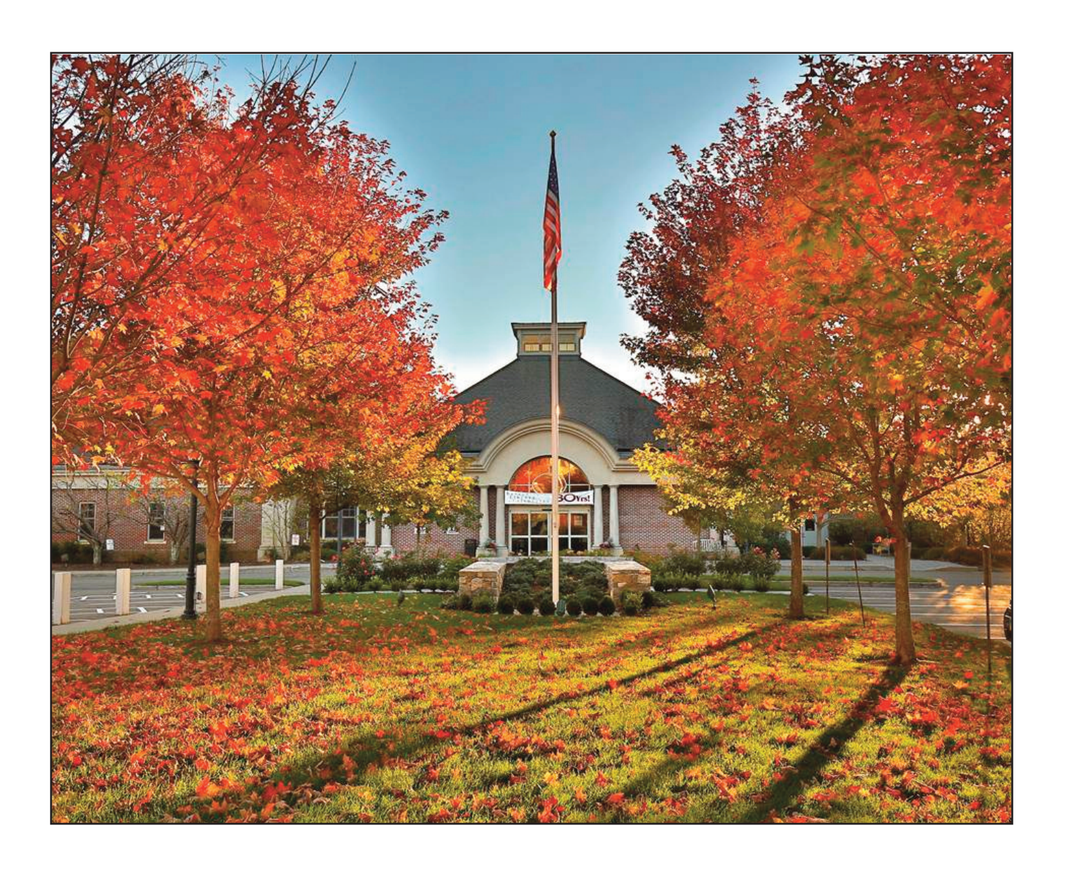
ANNUAL REPORT 2014